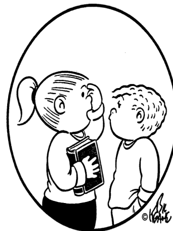
"Conscience is e-mail your head gets from God."