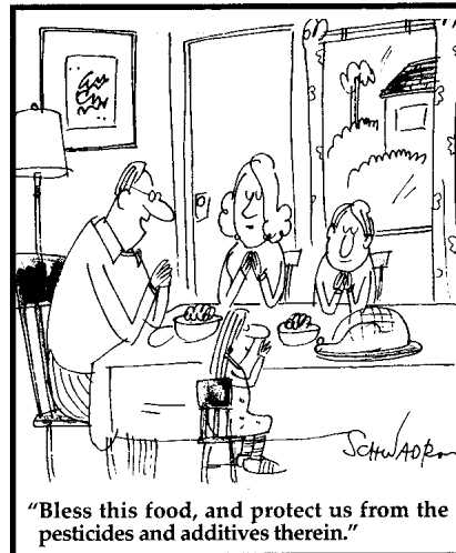
"Bless this food, and protect us from the pesticides and additives therein."