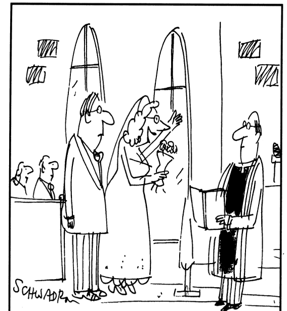
“What an inspiring service! I want you to do all my weddings!”

Ministry Schedules for those without email are now available in the Gathering Area. Please pick up your copy.